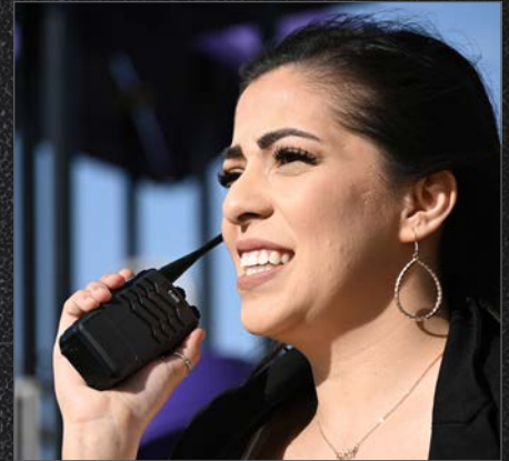
School staff members operate cost-effectively using direct mode communications.