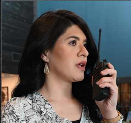
Hospitality teams deliver better customer service when communicating efficiently.