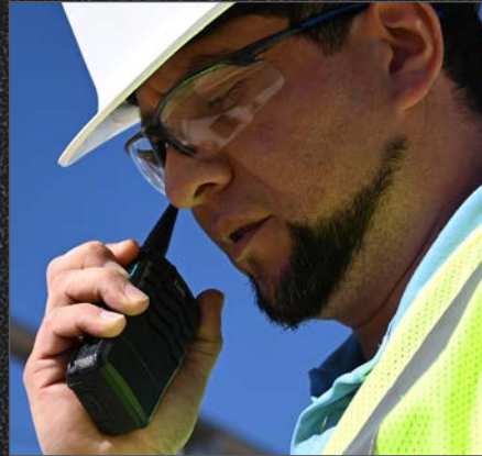
Construction crews hear instructions loud and clear using digital DMR technology.